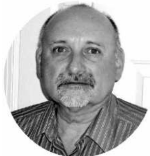
A message from the Grand Knight